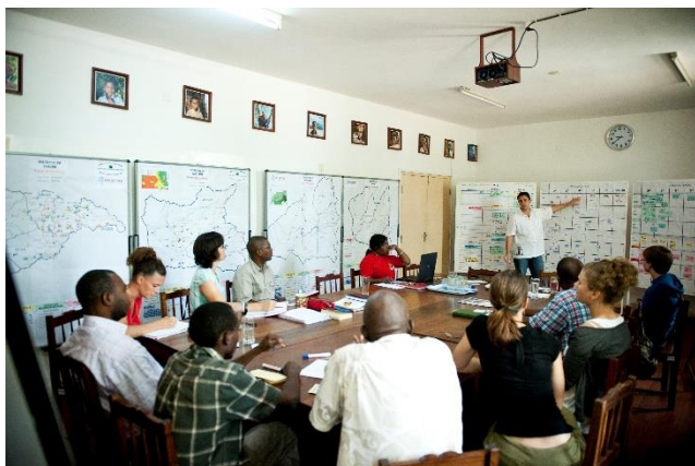
Participatory Monitoring, Evaluation, Accountability and Learning (MEAL) in Pemba, Mozambique.

Our technical experts provide thematic advice to and support knowledge management of SDC's e+i (employment and income) network in the areas of systemic approaches to private sector and financial sector development, and vocational skills development.