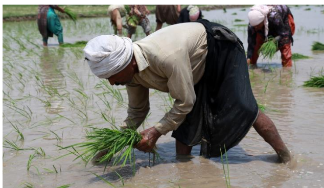
Rice production in Pakistan, WAPRO project.

A tool developed by Helvetas proven to be effective is the Push-Pull-Policy approach , implemented in partnership with government institutions, local or international private companies, and CSOs. This innovative approach effectively combines the training of farmers in water-saving practices and technologies in key value chains (the Push component), the articulation of companies' demand and their incentives for reduced water consumption and crop diversification (the Pull component), and the support for an enabling policy environment (the Policy component).