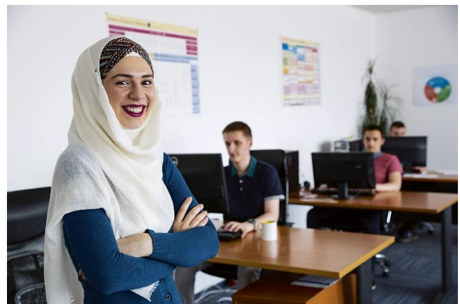
Continuing education in the IT sector.

The goal of MarketMakers is to contribute to increased employment and self-employment of young women and men in Bosnia and Herzegovina. The project achieves this by stimulating market systems to deliver services and to establish rules and regulations that work better for the private sector. The project also provides access to growth opportunities, investment, and thus an increased demand for labor. Helvetas works in IT and business process outsourcing, as well as the food industry and tourism sectors, to build a better environment for private enterprises in these industries to create jobs for young people; link up actors in the employment market; and remove legal or perceptual obstacles to sectoral development. Market Makers has so far helped to generate around 1,500 jobs for young people. Additionally, Helvetas has supported the creation of an association, which has grown to around 20 IT companies from across the country. The association, among other things, is investing in improving vocational and university education.