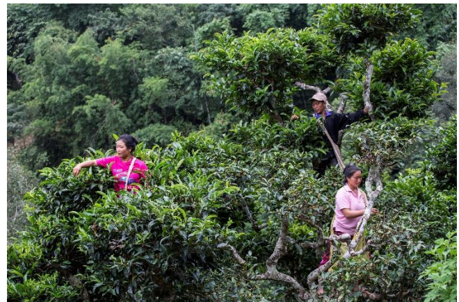
Tea growers in Laos.

Rural MEs will be supported toward commercial viability through the transfer of financial literacy and entrepreneurship skills, access to technologies, credit, and services, and economies of scale. The project will promote access to finance and dialogue in public fora on enabling environment issues that constrain ME growth. The project will leverage existing systems and resources, including partnering with GOL at the provincial and district levels to build their capacity to deliver enterprise training.