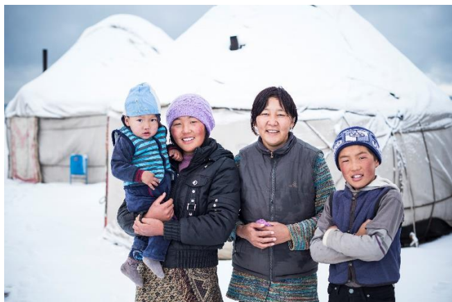
Community-based tourism in KGZ.

By the end of 2019, the total number of beneficiaries of the program's third phase reached 6,779 people, with 49% of them being female, and 25% youth. At the same period of time, the total value of sales by local producers and entrepreneurs in selected sectors (cattle, agriculture, tourism, and handicraft) was $994,592.